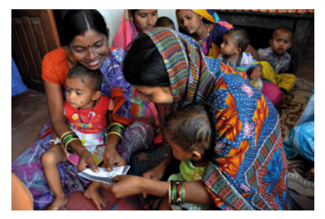
Figure 5.5 Yours, mine, ours, and a few others: A group of mothers and children at a village health camp.

After settings are delineated, it becomes possible to disentangle two different dimensions in the caregiving process: the attention that a child receives and the focus of the adult. These two features coincide in the one-child–one-adult setting, but they do not in other settings. For instance, when a mother in a one-child–one-adult setting exhibits co-occurring or concurrent care (e.g., did other things around the home while caring for the child), the child receives distributed attention from the adult because the adult is focusing on the child as well as on other things (Saraswathi and Pai 1997). Under the two settings where "many adults" are involved, a child could receive concentrated attention from another adult (e.g., a grandmother) during the time in which the primary caregiver focuses on other activities.