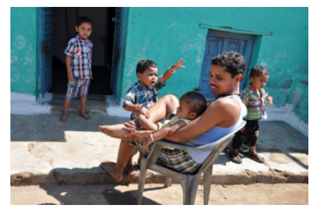
Figure 5.4 Soaking in the warm winter sunshine, a father looks after the family's children.

very little (if any) specific assignment of responsibility. Much of the interaction with the child seemed to move seamlessly from one adult to another. Another feature of the many children context (both with one adult as well as with many adult caregivers) was the observed care-giver-like behavior among the children: older children often assumed responsibilities for their siblings and cousins. The greater the age difference among the children, the more alloparenting among siblings/ cousins was observed, with adults actively encouraging grouping and mutuality in their interactions (see Figure 5.5).